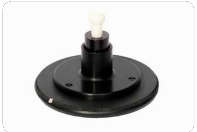
Figure 2. The powder holder should be used ONLY for color difference measurements.