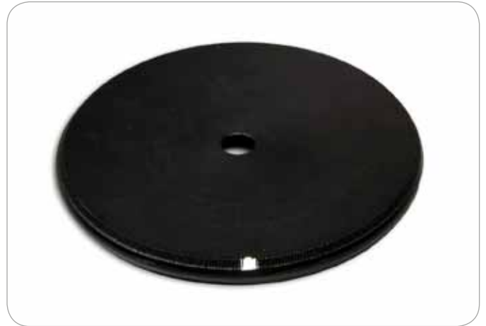
Figure 1. The Small Area View (SAV) or VSI options are required. Performance specifications will not be met with this smaller-than-standard port plate. The change of geometry with this option will cause a slight shift in the color values of the calibration standards.

For small quantities of powder, HunterLab has designed a special modified port plate for reflectance measurements of approximately 0.4 cc of packed powder. The sample is scooped into the powder holder and packed down with a plunger. The powder holder is then placed in a specially-designed port plate and the powder measured through the holder's clear window.